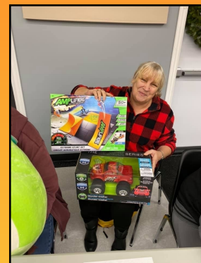
Winners of Mi'kmaq Bingo